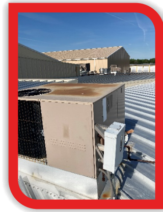
Principal's Office RTU