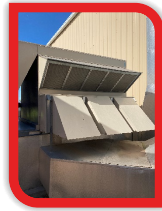
Alternate Gym RTU