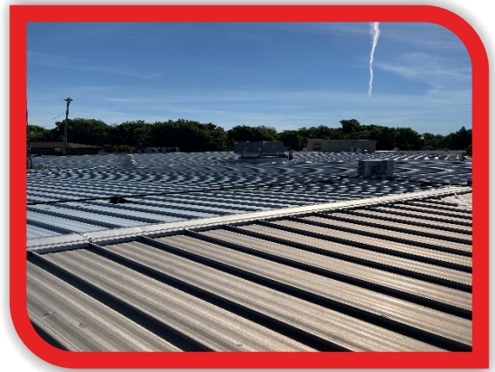
Metal Roof Over Flat roof