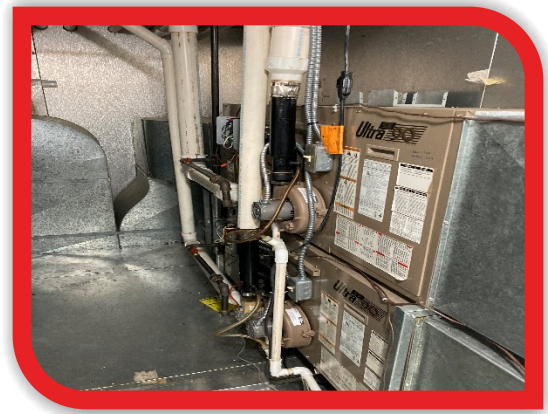
Cafeteria and Stage heating system