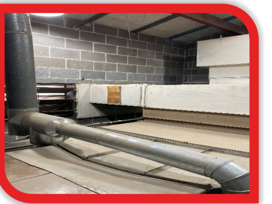
Main Gym Ductwork