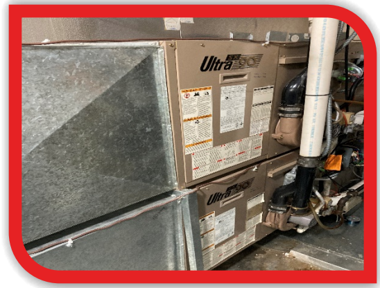
High School Mechanical Roof