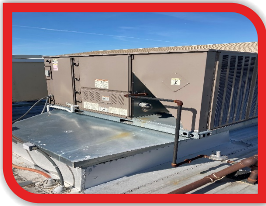
New Library RTU