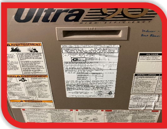
Furnaces for Locker Rooms 1 of 2