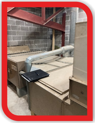
AHU Main Gym 1 of 2