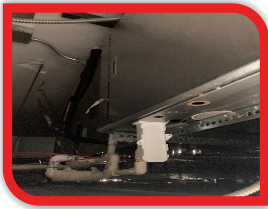
Elementary Fan Coil