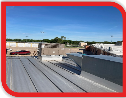
Kitchen RTU and make up air unit (MAU)