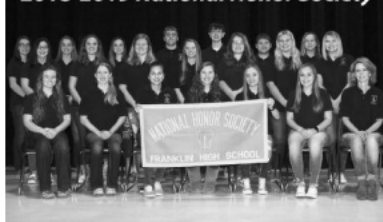
2018-2019 National Honor Society