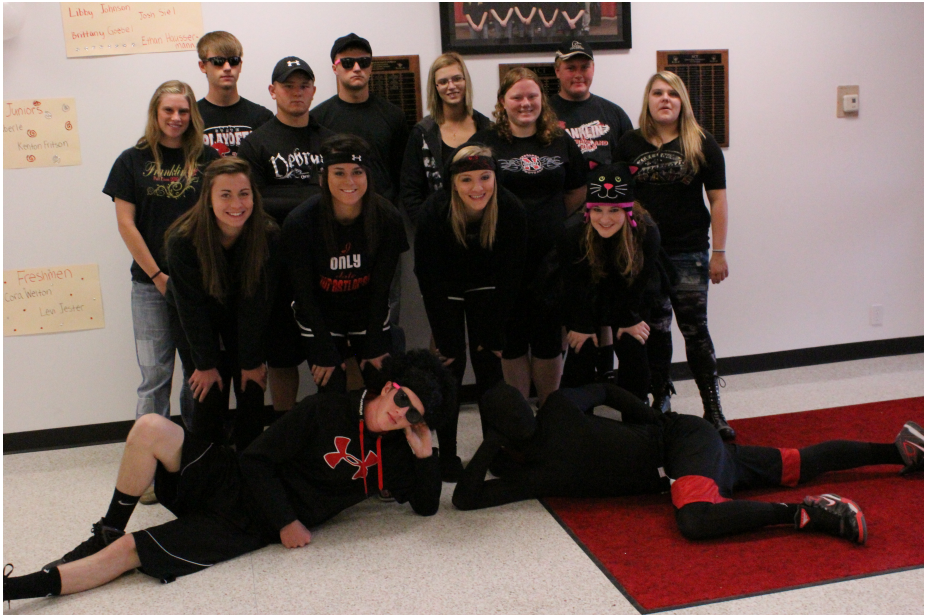
Above: The senior class shows off their black on Monday for color wars! Everyone enjoyed dressing up for Spirit Week.