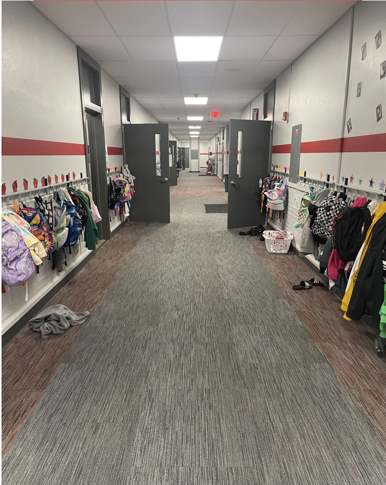
2nd Floor Hallway