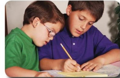
Student Achievement Rating