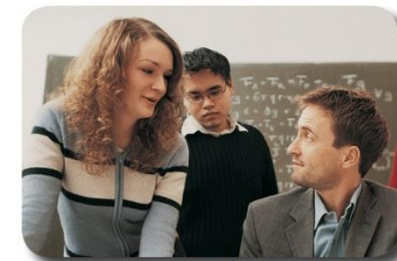
Professional Development Rating