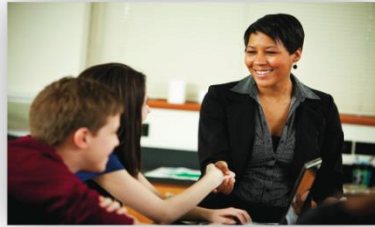
Effective Practices Ratings