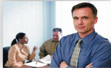
Professional Development Rating