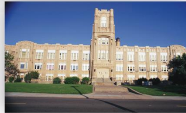
Impact on Student Learning and School Performance Rating