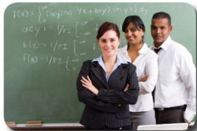
Local Factors Rating (optional)