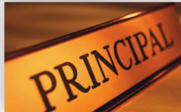
Local Factors Rating (optional)