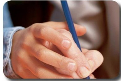
Effective Practices Ratings