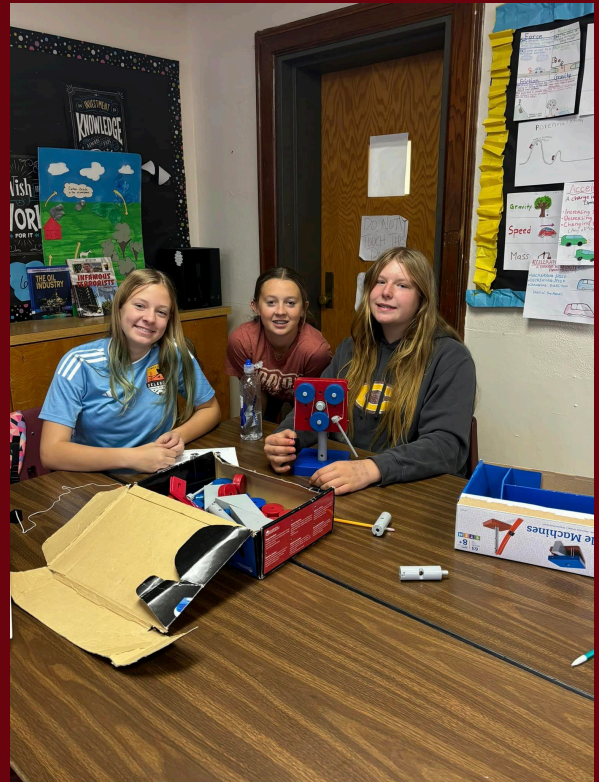
Physical Science students are building simple machines.