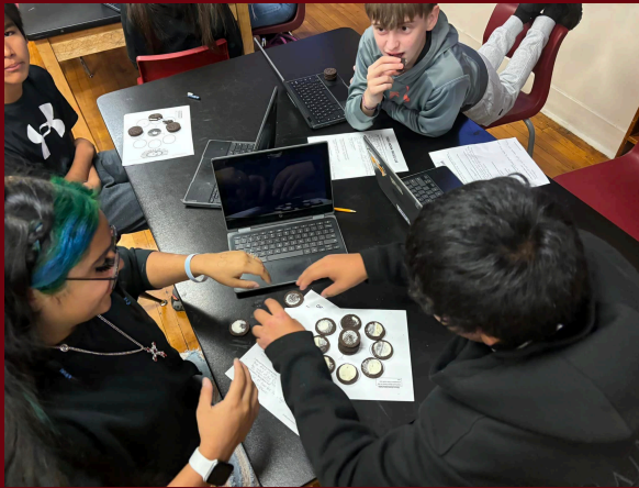
8th grade science demonstrating the phases of the moon with Oreos.