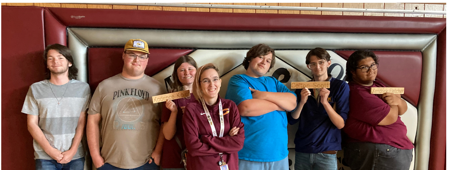
Academic Team 2 Placed Second at the Blair Tournament