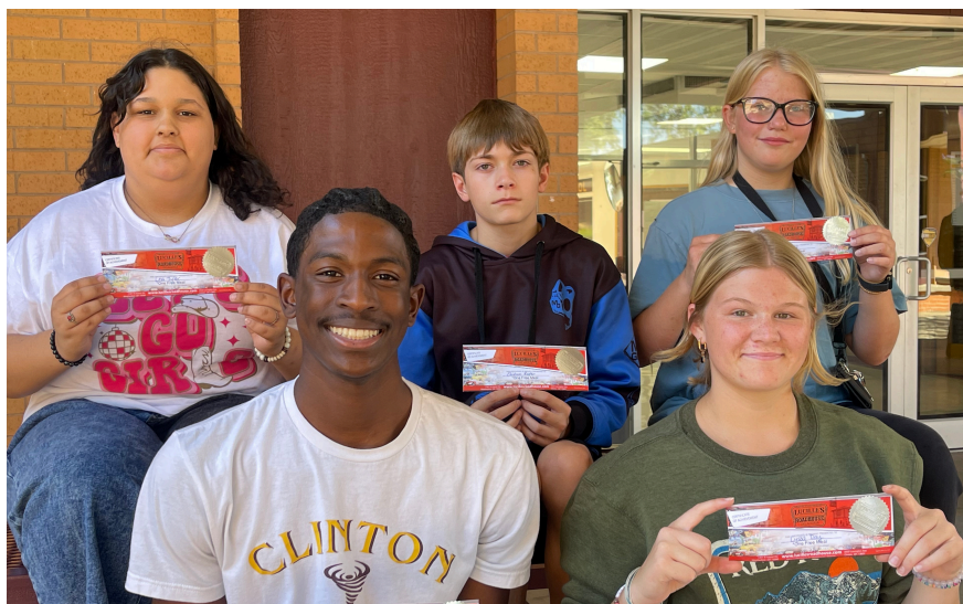
Congratulations to our October Students of the Month who were chosen for their leadership on and off campus. (Not pictured-Scout Acosta)