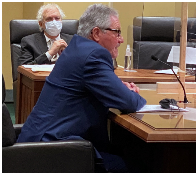
Columbus Mayor James Bulkley testifies in support of LB 542.