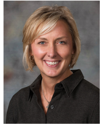
Sen. Lynne Walz