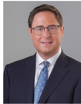
Sen. Mike Flood

AND would remove barriers in Nebraska law for public entities to lease publicly owned dark fiber if broadband speeds are below 100/20. Current law removes the barriers if broadband speeds are below 25/3. The barriers potentially removed are discussed later in this article.