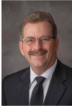
Sen. Bruce Bostelman

The first amendment offered to LB 338 was AM803 offered by Sen. Bostelman. AM803 raised the speed standard in LB 338 from 25 megabits per second download and 3 megabits per second upload (25/3) to 100 megabits per second download and 20 megabits per second upload (100/20), require enhanced speed testing of providers,