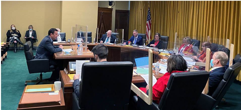
Norfolk Mayor Josh Moenning testifies before Revenue Committee March 31 in favor of LB 542.