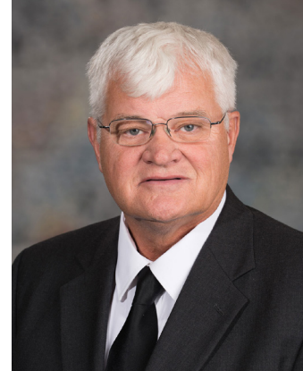
Sen. Mike Groene

Agreements may not last more than 10 years after the date of application. Matching funds are to be disbursed on an annual basis. An applicant is entitled to receive matching funds from the State of Nebraska: for any amount of investment up to $2.5 million made by the applicant by the end of the transformational period, the applicant is entitled to receive $2 of matching funds for each such dollar of investment; and for any amount of investment in excess of $2.5 million made by the applicant by the end of the transformational period,