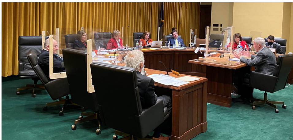
Wahoo Mayor Jerry Johnson testifies before Revenue Committee March 31.