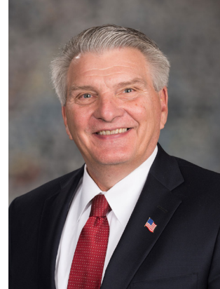
Sen. John Stinner

requiring "4 or more" criteria to be met before automatically accepted bids can be made; eliminating the "catch-all" provision for using automatically accepted bids; adding language to allow a board member to be removed for good cause; providing that the city of Lincoln may not hold legal title to more than 7 percent of the total number of parcels in the city and no more than 5 percent of those parcels can be commercial property; and prohibiting a land bank from acquiring commercial property unless it has been vacant for three years.