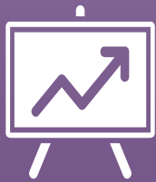
MAP Reading Percentiles Fall 19 to Fall 20 by Cohort