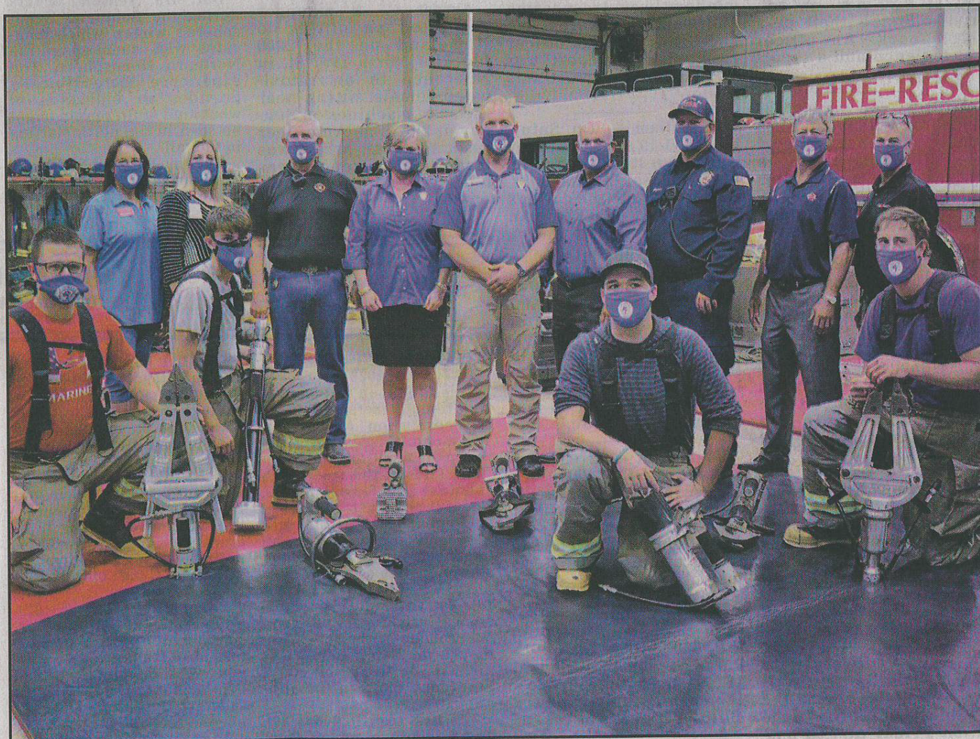
PIONEER TECHNOLOGY CENTER recently received new extrication equipment and an enclosed trailer. The items were purchased through a partnership with Northern Safety & Industrial who discounted former demonstration equipment.

For more information about Pioneer Tech's Firefighter/EMT Program or its services call 580-762-8336 or visit pioneer-tech.edu .