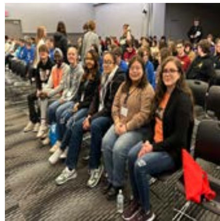
LEXINGTON ACADEMIC DECATHLON TEAM