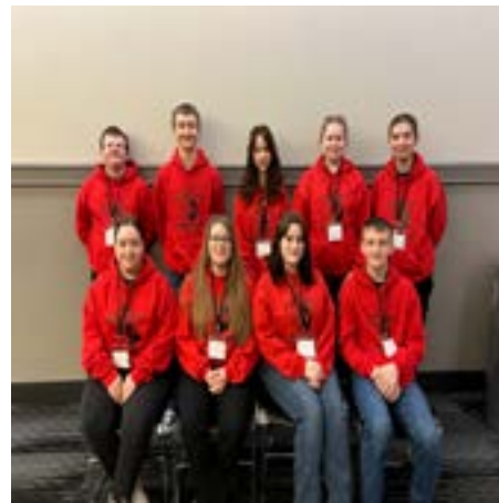
JOHNSON COUNTY CENTRAL ACADEMIC DECATHLON TEAM