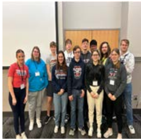
ADAMS CENTRAL ACADEMIC DECATHLON TEAM