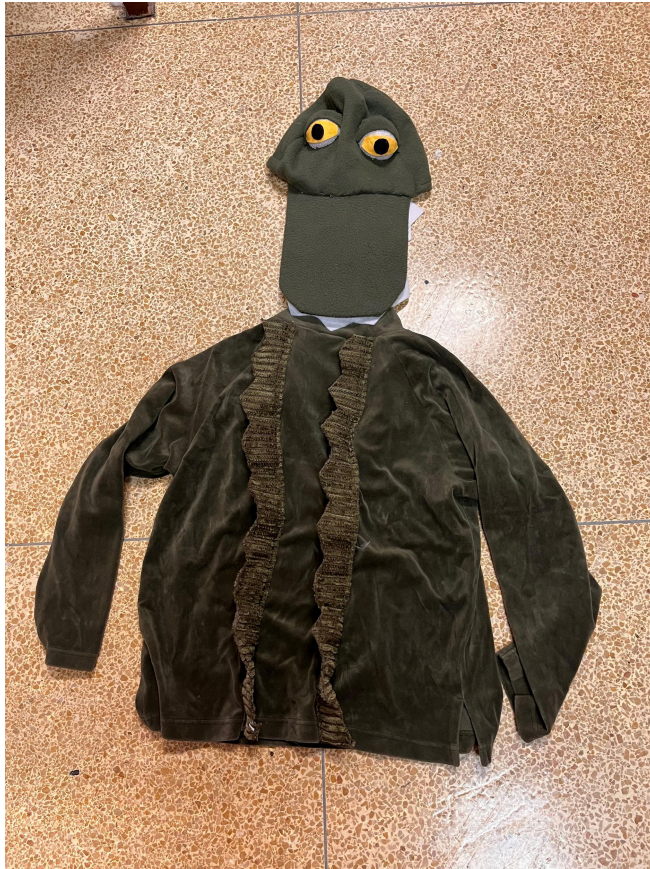
Frogs (4) - hats only