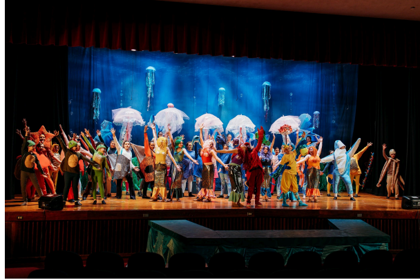
Seahorses (2) 1 S, 1 M - hooded sweatshirts with attached tails (leggings not included)