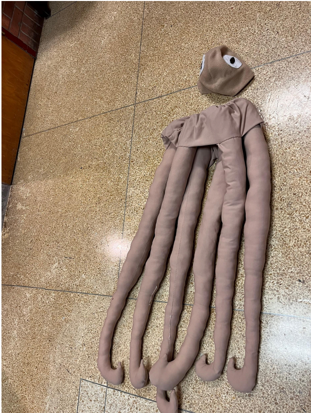
Jellyfish (6) - umbrellas with lights on tentacles (3 dark pink, 3 light pink)