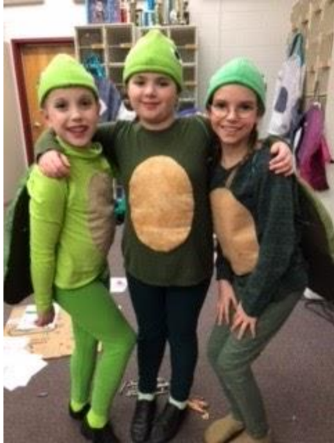
Dragonfly (2) - wings (worn like a backpack)