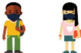
self-monitor, no quarantine