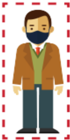
individual must ISOLATE