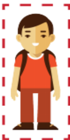
individual must ISOLATE