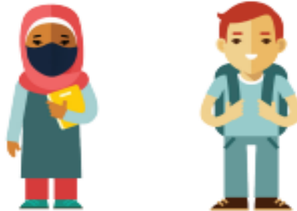
self-monitor, no quarantine