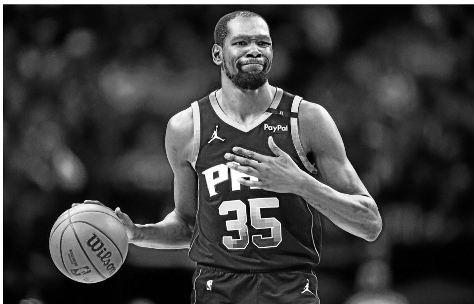
JULIO CORTEZ, AP FILE

Source: Nebraska Statewide Study 2025, Coda Ventures