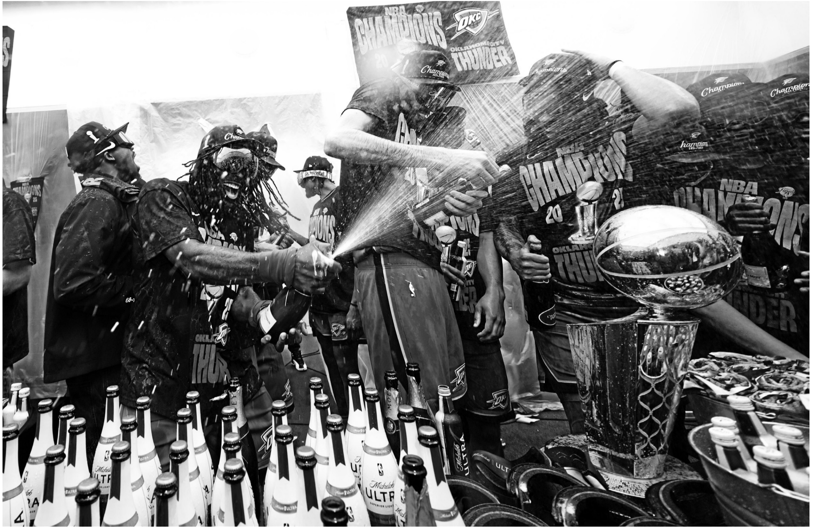
JULIO CORTEZ, ASSOCIATED PRESS

Houston finished 16 games behind Oklahoma City in the Western Conference and still got the No. 2 seed for the playoffs. The Rockets are hoping to close that gap now that they've added one of