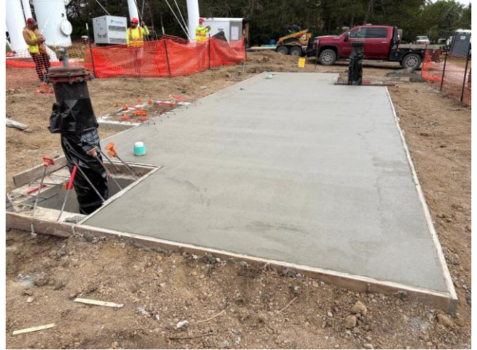
5/6: Completed floor slab pour.