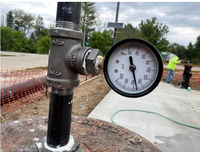
5/8: Pressure at the start of the test - 8:15am.