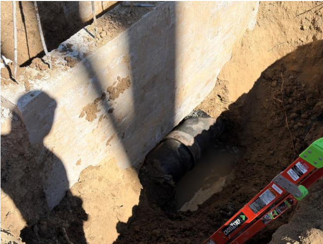
5/7: Leak from the bell of 12-inch suction line.