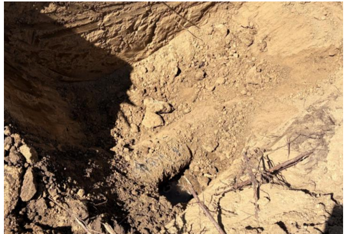
5/7: Leak from the bell of 12-inch suction line.