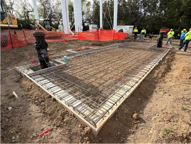
5/6: Riser pipe installation suction and discharge line, rebar complete in floor slab.