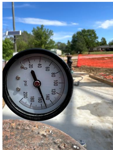
5/8: Pressure at the end of the test - 11:15am.